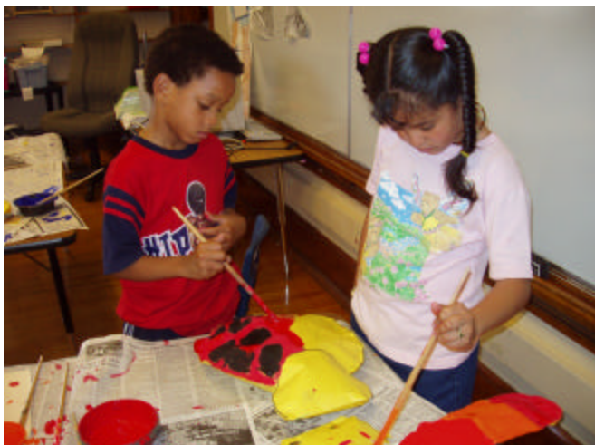
Students enjoyed the many afternoon Wrap-Around activities that included trips, games, arts/crafts.