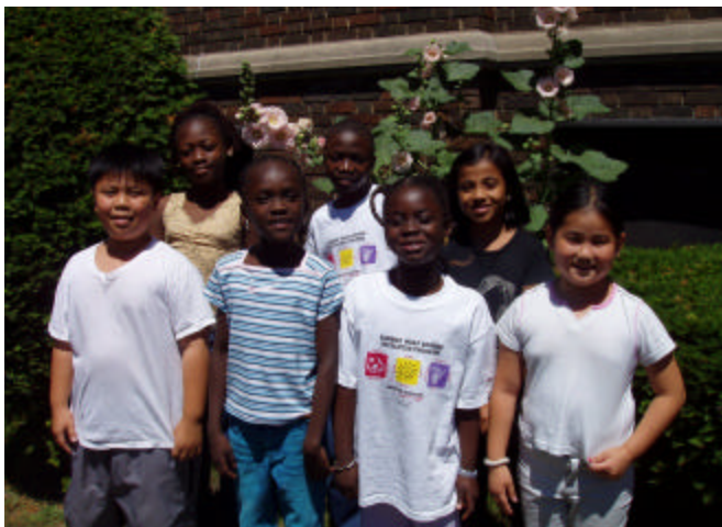
ELL students from around the world (Laos, Liberia, Nepal and Nigeria) all smile in the same language.