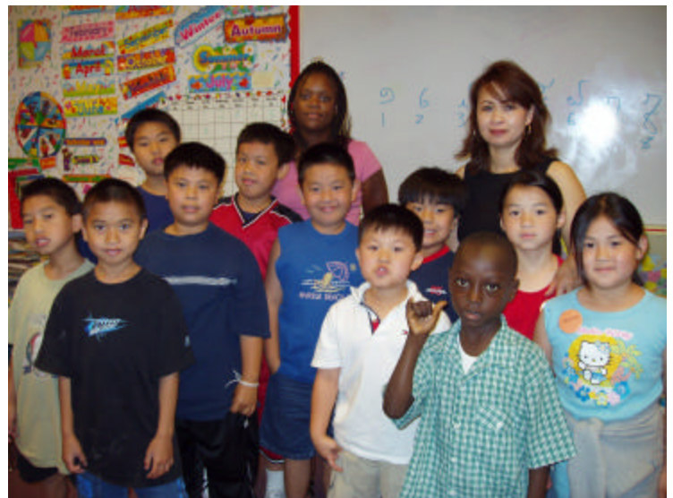
ELL students and their summer school teachers.